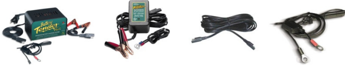
• Tender Plus • Tender Junior • Extension Leads • Ring Terminal Harness

Battery Maintenance – The reliability of your vehicle depends on the battery! Letting it sit for long periods of time unattended can not only drain it of cranking power in the short term, but reduce its overall life and possibly void your warranty in the long term.